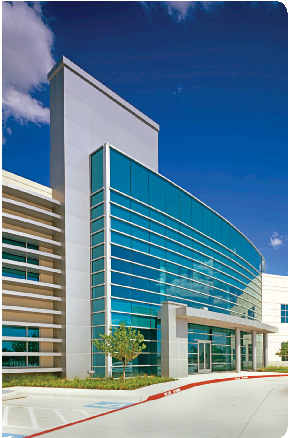
Vistacool® Azuria® glass, seen here on the Transwestern Gateway Corporate Center I in Coppell, TX., features a rich tropical blue tint and better visible light transmittance than similarly tinted blue glasses.

O'Brien said the decision to specify Vistacool® Azuria® glass for his project was driven by its aesthetics and performance characteristics.